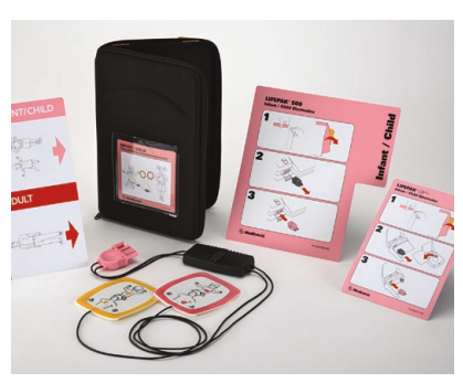
Infant/Child Reduced Energy Defibrillation Electrode Starter Kit

For use only with LIFEPAK® 500 Biphasic AED with pink connector or LIFEPAK 1000 defibrillator, LIFEPAK EXPRESS® AED, or LIFEPAK CR® Plus AED. For use on children less than 8 years of age or under 55 lbs.