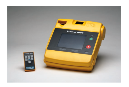
The Trainer 1000 provides realistic training for LIFEPAK 1000 defibrillator users.