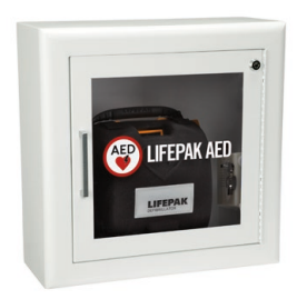
Surface Mount (7" Return)

AED Wall Cabinet with Alarm 11220-000079 (White) 11220-000076 (Stainless)