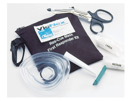
AMBU® Res-Cue Mask® First Responder Kit

Includes 2 sets of disposable vinyl gloves, 1 reusable mouth barrier mask with valve and filter, 1 disposable razor, 1 disposable anti-microbial wipe, and 1 pair of trauma scissors.