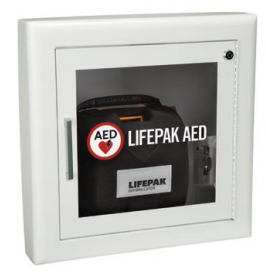
Semi-Recessed (3" Return)

AED Wall Cabinet with Alarm and Strobe 11220-000083 (White) 11220-000084 (Stainless)