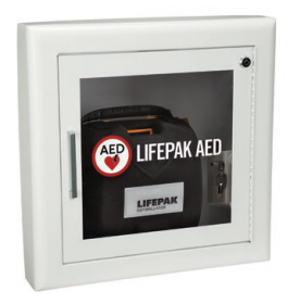
Recessed Mount (1.5" Return)

AED Wall Cabinet with Alarm, Fire Rated 11210-000026 (White)